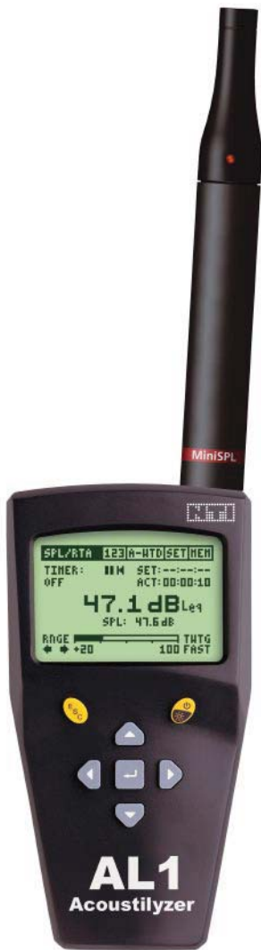
Acoustilyzer AL1 with MiniSPL measurement microphone