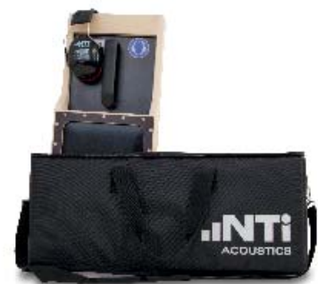
\delta -Clapper (Scope of Delivery)