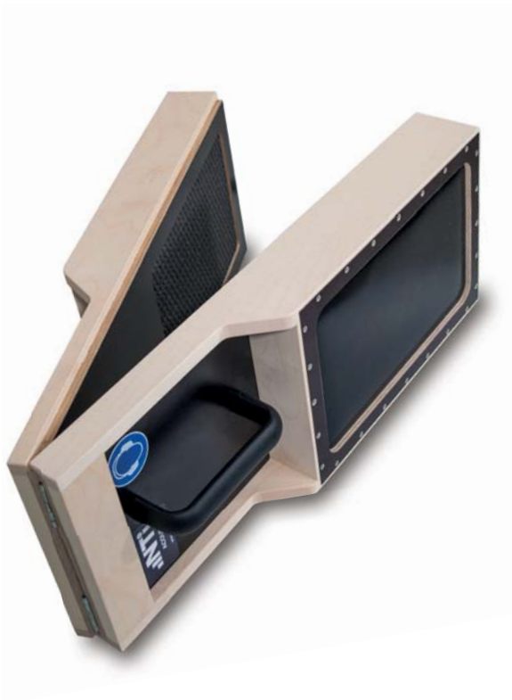
\delta -Clapper, Impulsive Sound Source

The \delta -Clapper is an easy-to-use impulsive sound source for reverberation time measurement in small and medium-sized rooms.