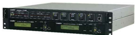
Combination of LT4600A and LT 4448