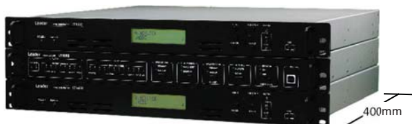
Combination of LT4610 and LT4448

The LT4448 can be controlled by a web browser.