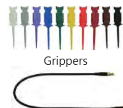
Grippers Stack cable