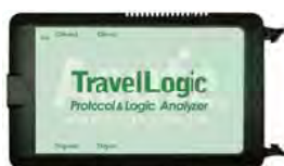
TL4134B / TL4234B