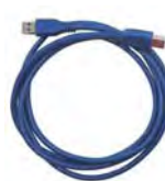
USB 3.0 cable